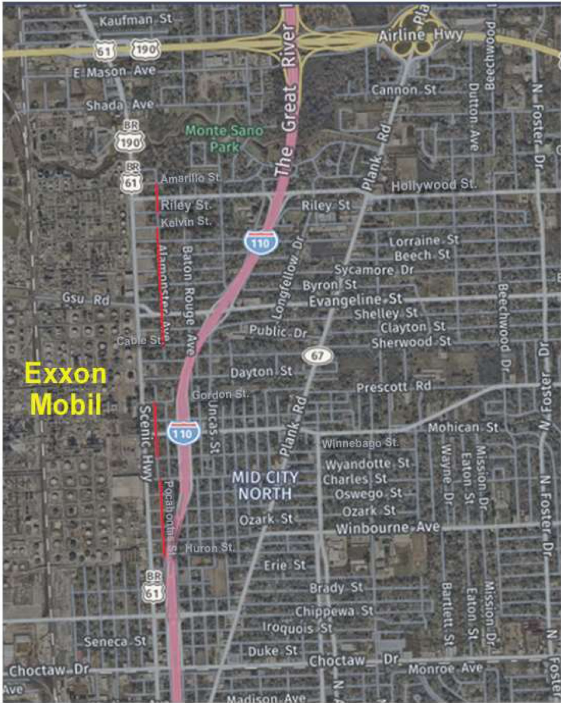
Exhibit 'A' Road to Trail Conversion